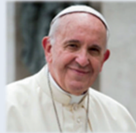
Pope Francis 1936—2025

Eternal rest grant unto Pope Francis, O Lord. And let perpetual light shine upon him. May his soul and the souls of all the faithful departed, through the mercy of God, rest in peace. Amen.