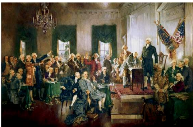
Scene at the Signing of the Constitution of the United States by Howard Chandler Christy, 1940

Growing up Catholic in Philadelphia, there were a few realities that simply went with the territory! In our living room, there was always an image of the Sacred Heart of Jesus, hung there by my parents in accord with the promises of Jesus to Saint Margaret Mary Alacoque. What memories I have of hearing my Dad whisper prayers to the Sacred Heart as he passed by that image! My folks instilled in us a deep love for Jesus and His Church! In the City of Brotherly Love and nearby, there was always the draw of historical places, and my parents made sure that early on we had an appreciation for history and a love for our country. What memories I have of my parents taking us on tours and visits to the Liberty Bell, to Independence Hall, and to Valley Forge. My folks instilled in us a deep love and respect for our country and for her citizenry.