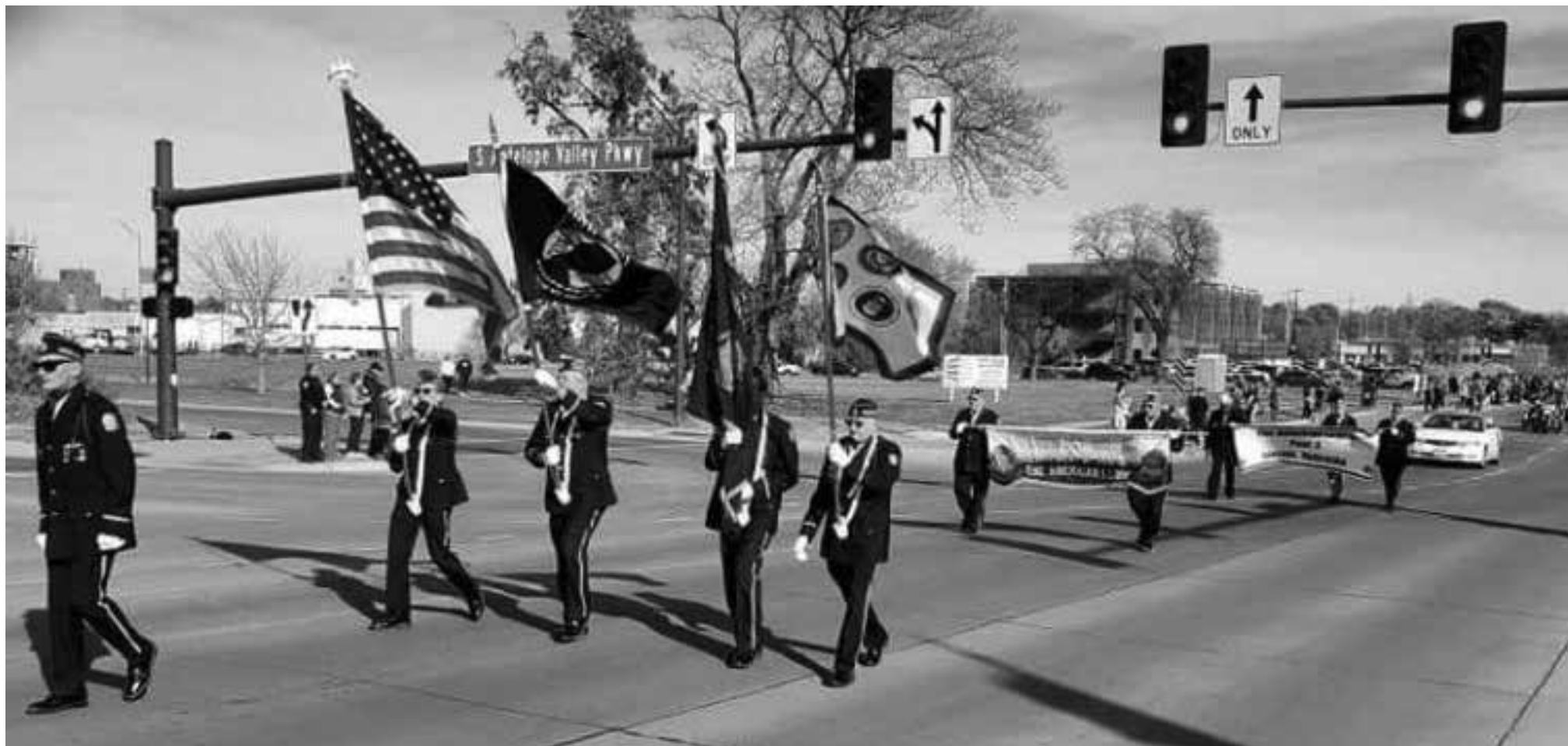
The Post 3 American Legion Family was well represented in the Lincoln Veterans Parade held on November 9th.