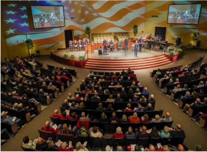
The audience, 1,157 in attendance