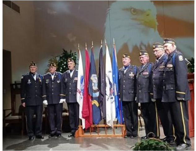
Post 3 military service branch flag bearers

(Pictures are from the 2024 St. Mark's Veterans Gratitude Service)