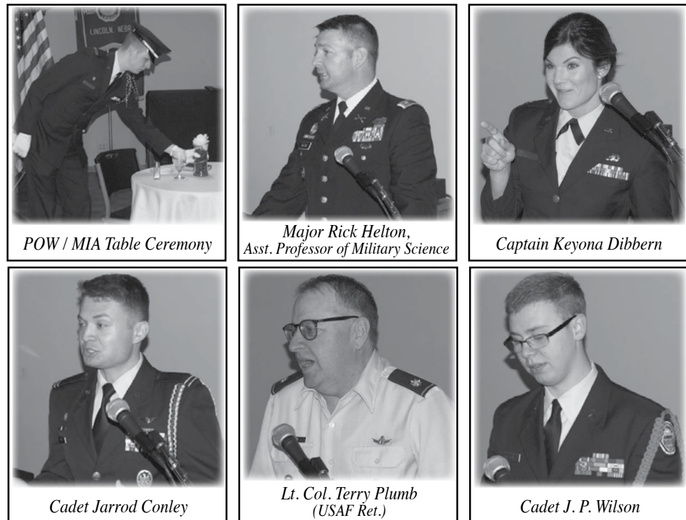
POW / MIA Table Ceremony