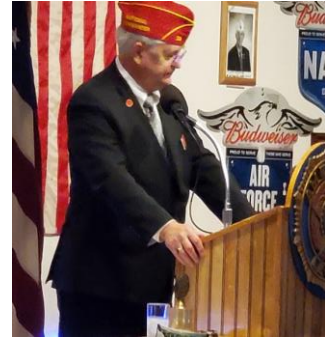
(AL National Commander visiting Legionnaires at ALP 1, Omaha, NE.