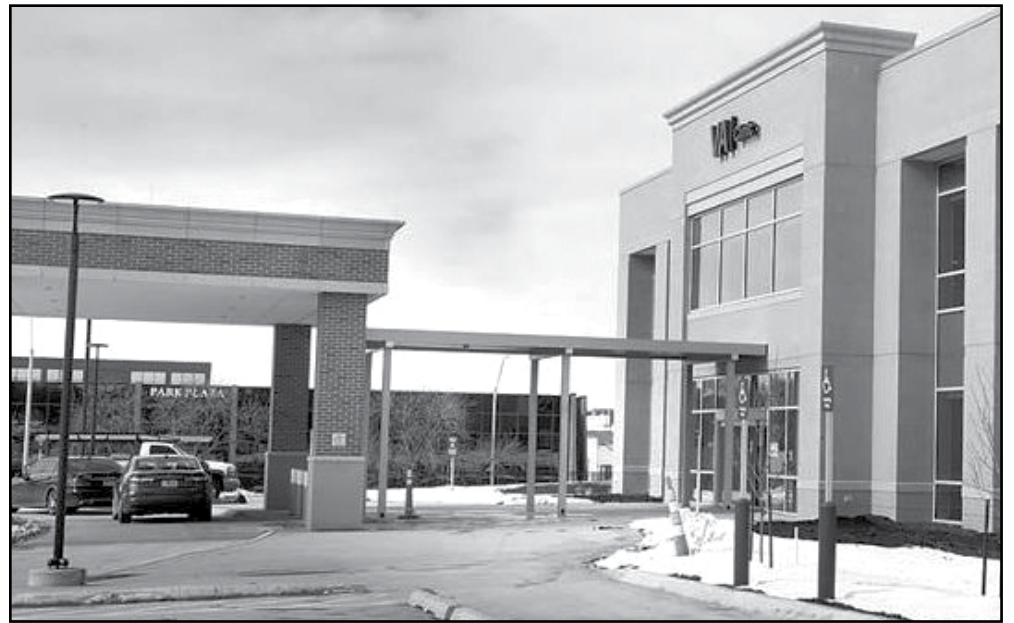
The new Lincoln Community Based Outpatient Clinic (CBOC), just south of 70th and “O” Streets in Lincoln.

To get the full use of the web site, you need to have a Premium My HealtheVet Account. To upgrade your account, you need to be authenticated. This only take a minute, so just stop and visit with the staff.