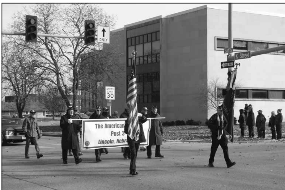
Several members of the American Legion Post 3 Family ---- Post 3, Auxiliary Unit 3, Sons of the American Legion Squadron 3, and American Legion Riders Chapter 3 ---- participated in Lincoln's Veterans Parade on November 13th.