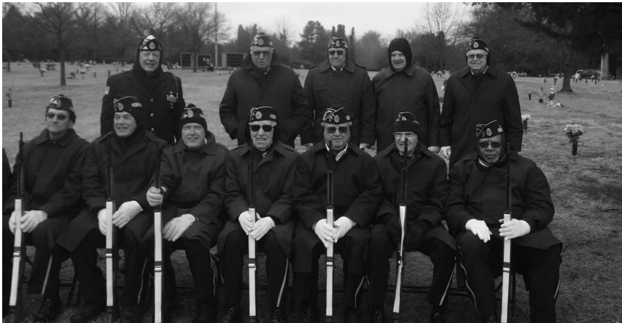
In December, a large crowd — including a good contingent from the Post 3 Honor Guard — gathered at Wyuka Cemetery for the annual Wreaths Across America Ceremony.