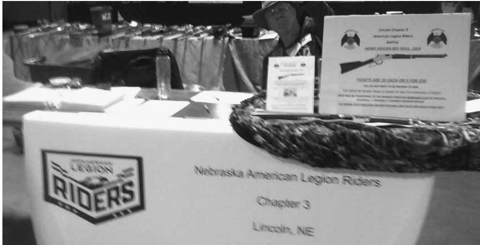
Lincoln Chapter 3 of the American Legion Riders had a table at the Lincoln Gun Show in January.