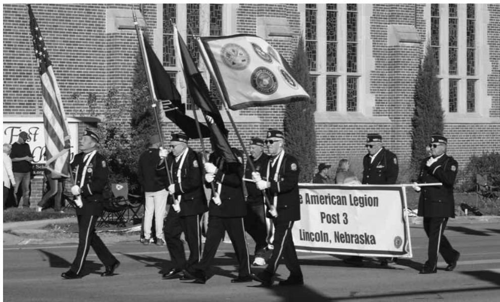
Lincoln held, and Lincoln's American Legion Post 3 participated in, the annual Veterans Parade on Sunday, November 12th.