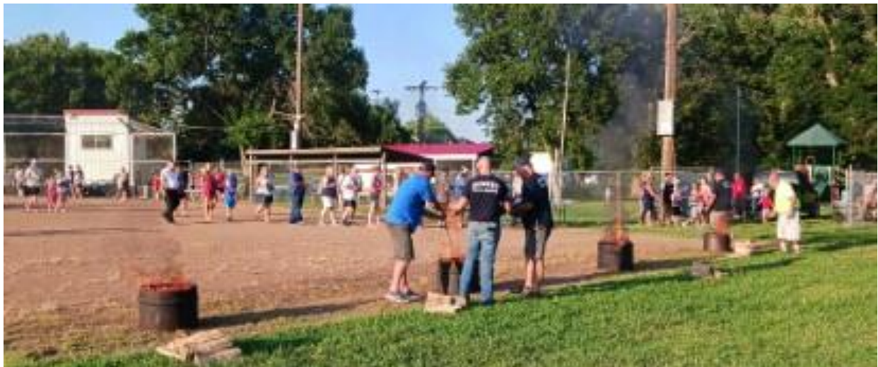
Bennet residents lined up to help with the Dignified Flag Retirement