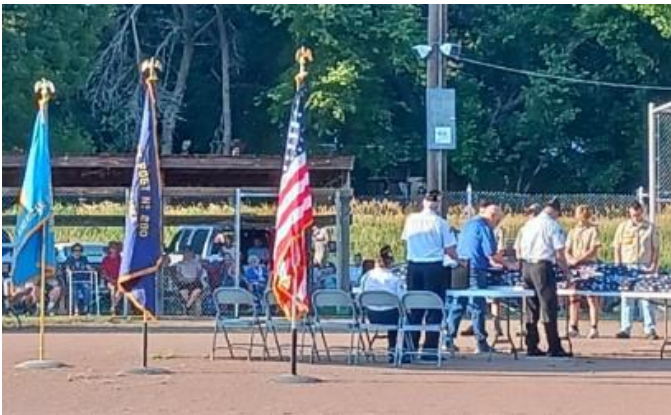
Bennet Dignified Flag Retirement Ceremony

It was awesome to see small town America in action.