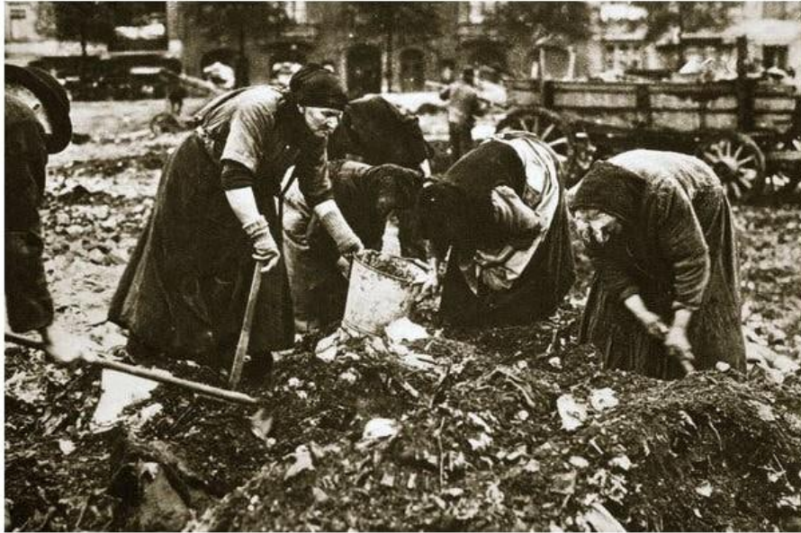
Rummaging for food in Berlin during World War I.

We remember the 1914 Christmas Truce as a moment of humanity amid war. Four years later, a darker tale unfolded.