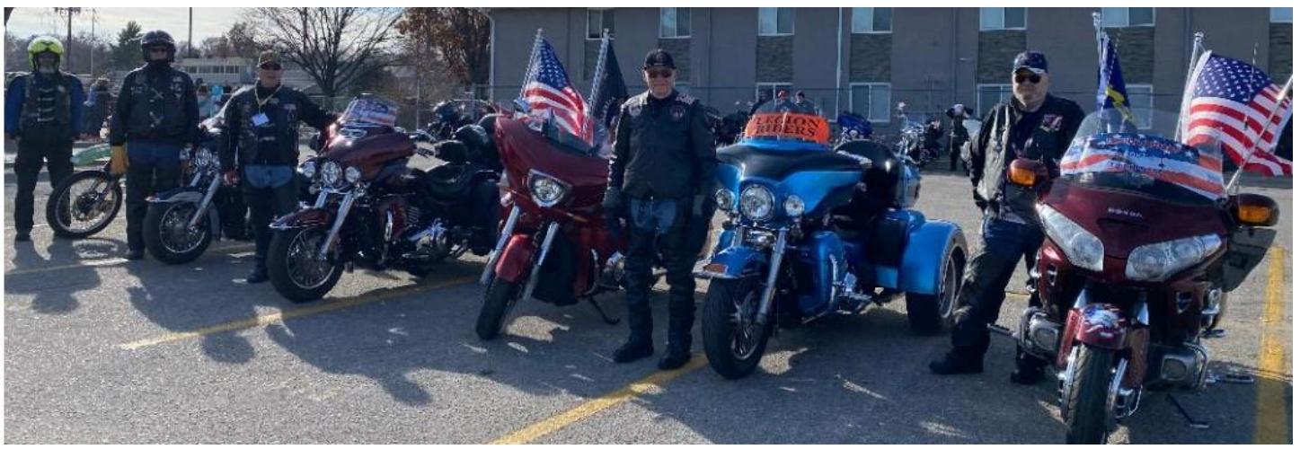
American Legion Riders taking part in the Lincoln Veterans Parade