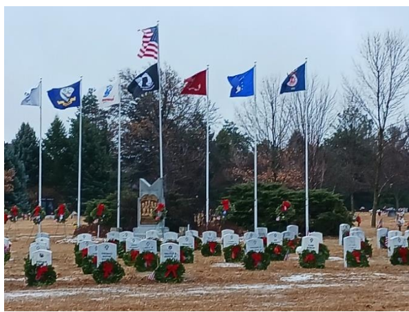
Wyuka Cemetery - New Soldiers' Circle