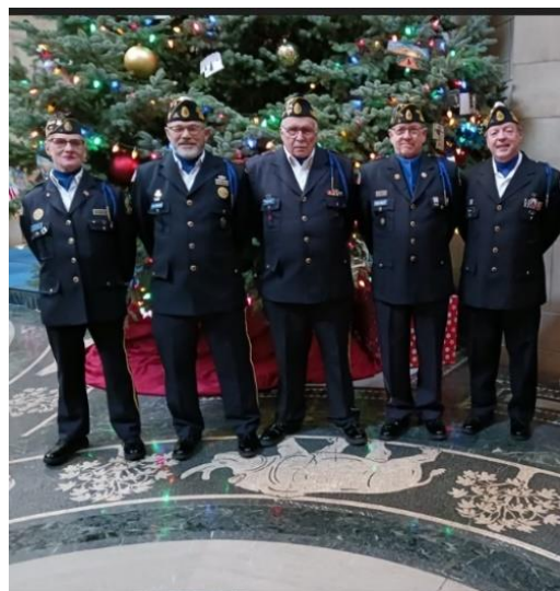
Post 3 members at the Governor's proclamation