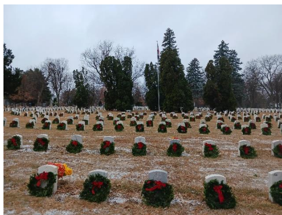
Wyuka Cemetery - Old Soldiers' Circle

The tradition of laying wreaths on veteran's graves to honor the veterans began in 1992, when Morrill Worchester Wreath Company, Harrington, Maine, donated 5,000 wreaths to be placed on the headstones of an older section of Arlington Cemetery.