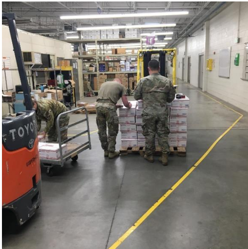
National Guard soldiers packing the donations