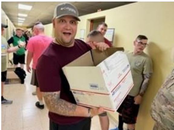
Nebraska National Guard soldiers surprised and smiling with their Christmas Care Packages