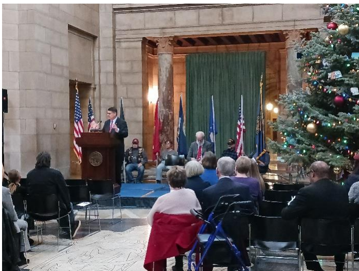
Governor's proclamation at the State Capitol