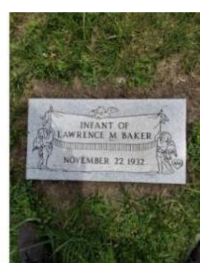
"Littlest Angel" headstone