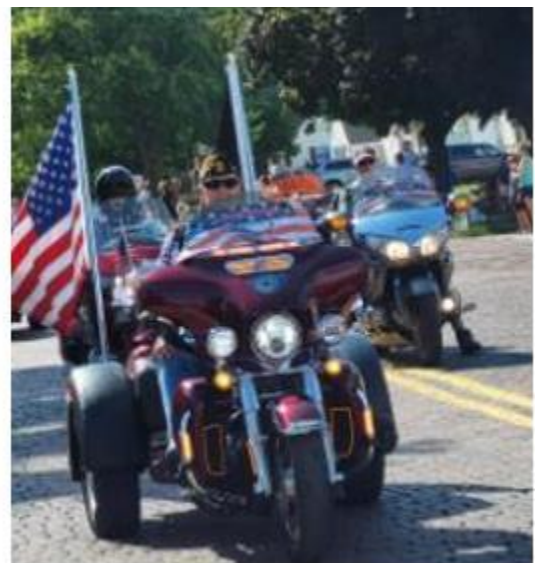
Milford Fun Days Parade