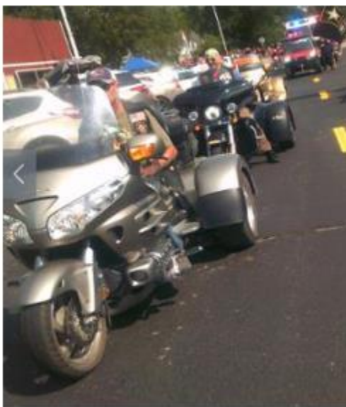
Hickman Hay Days Parade