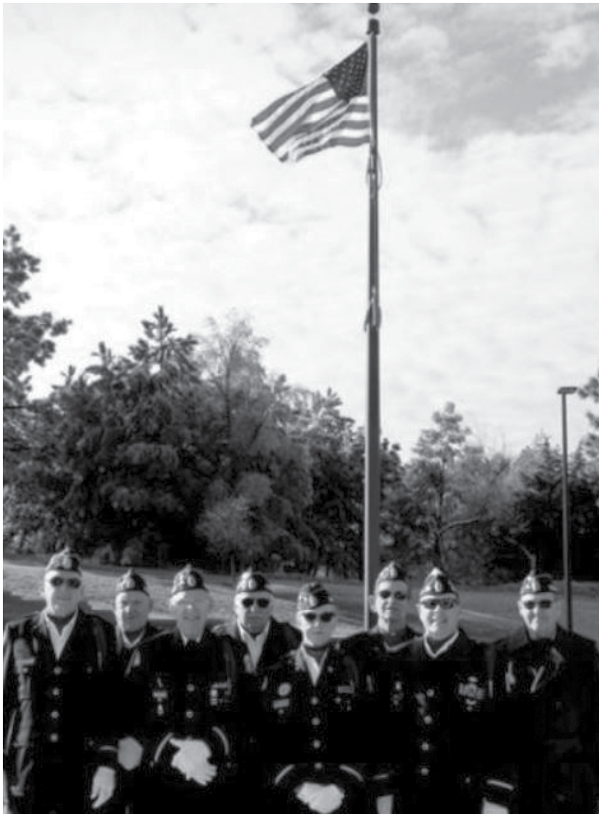
The Post 3 Honor Guard conducted a Veterans Day ceremony on Veterans Day for the residents at Pemberly Place, a senior living facility located in Lincoln.