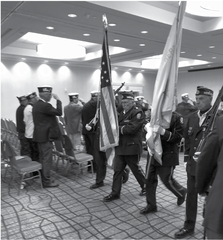
The Post 3 Honor Guard presented and retired the colors to open and close the 2021 Department Convention recently held in Lincoln in June. Additionally, the Honor Guard conducted a Post Everlasting Ceremony during the joint opening session at the convention.