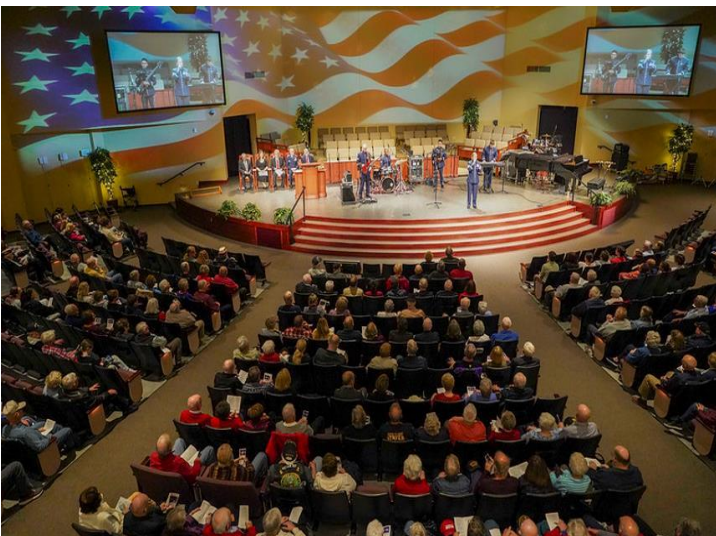
The audience, 1,157 in attendance