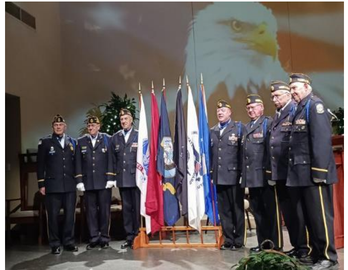
Post 3 military service branch flag bearers