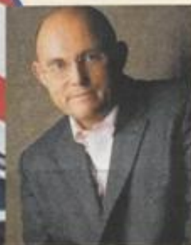
RONAN TYNAN WORLD-RENOWNED IRISH TENOR OMAHA EVENT