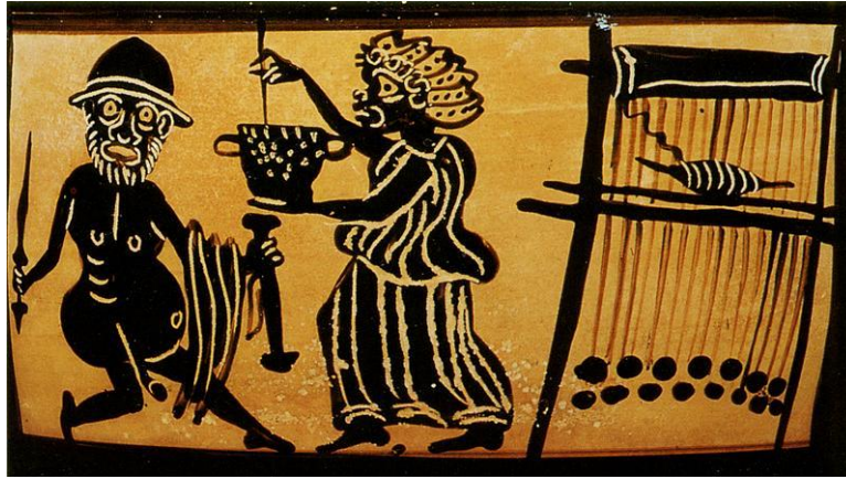
Image 4: Kyphos pot depicting Circe serving Odysseus her potion