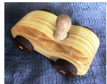
Figure 1 Figure 2 Figure 3 This is after one coat.