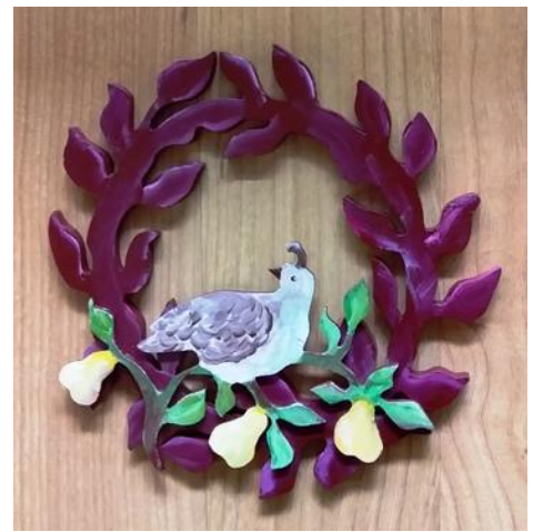
At right, from Brian Crowe: "I decided to have a go at intarsia, this is the result. The dark wood is blackwood and the white wood is camphor laurel with pine as the background, it was a lot of fun."