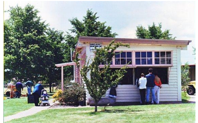
Club members soon provided walls & windows.