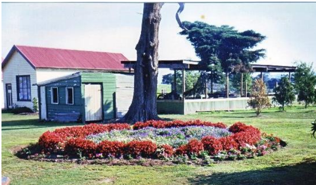
The clubroom started life as a hayshed with no walls somewhere in the late 1980's /1990's

Like so many of us at this time, I've been doing a little armchair travelling. Wandering through the files on my computer. I have found these photos, showing the club's progress over the years that it has been in the grounds of The Old Cheese Factory.