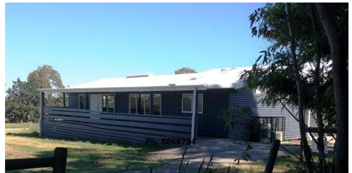
The vastly larger premises, officially opened in March 2019.