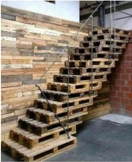
A recycling idea?

That's all for now until next time. Keep well and best wishes to you all.