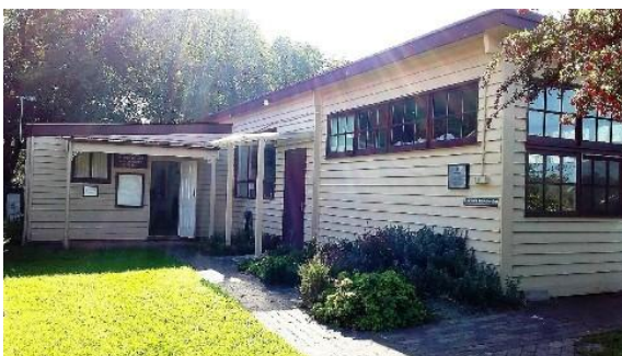
The club's home until 2019 with the extra room built by club members