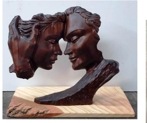
At right and below is Brian Crowe's collection of Expo entries