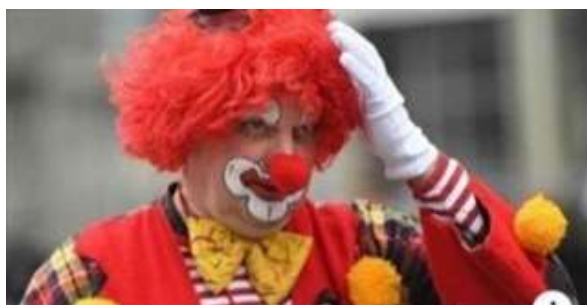
DAILYSQUAT.COM Circuses struggling to find new clowns as top prospects continue to go into politics

That'll do for now. With thanks, once again, to Carol Goddard for help with proof reading.