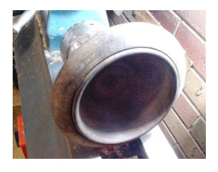
Memo to self-Forget about turning Grass Tree in future.

Just a reminder, this is how the Grass Tree bowl looked before completion.