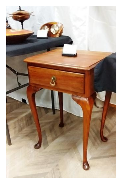
Don's side table