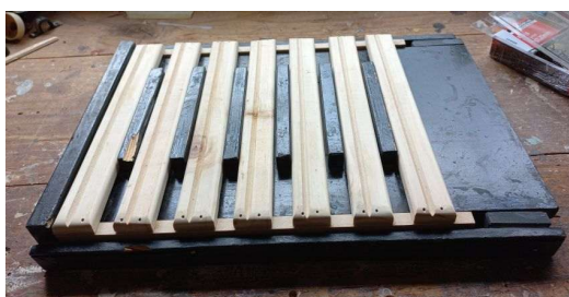
Bed ends, glued and nailed.