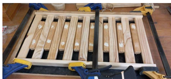
Mattress base, glued and clamped without nails.

MANY THANKS for the continued support of our sponsors.