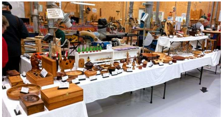
A reminder of one of the sales tables at last year's expo.

The Expo sub-committee will be meeting again at 10.30am on Wednesday 16 th April in the clubrooms & new members are always welcome. In the meantime, get busy with your entries.