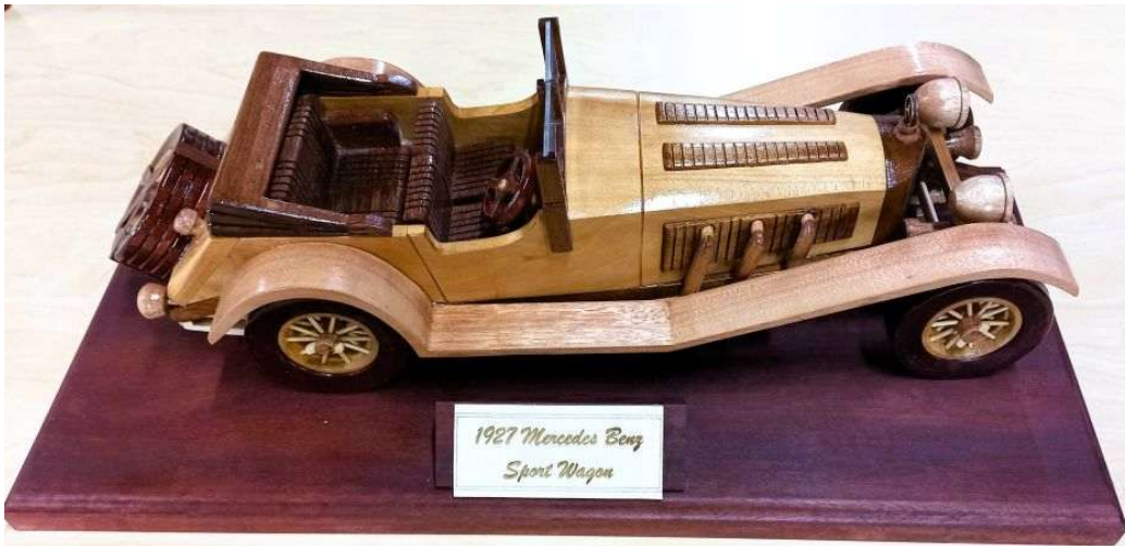
The 1927 Mercedes Benz car in various woods plus a few toothpicks is by Brian Crowe .