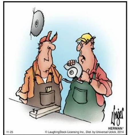
"See that?! I forgot to tighten the nut."