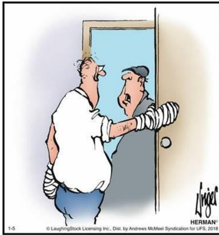
"You the guy with the hedge trimmer for sale?"