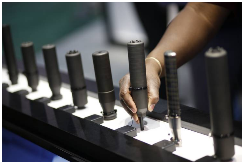
Silencers are on display at the Sig Sauer booth at the Shooting, Hunting and Outdoor Trade Show on Jan. 19 in Las Vegas.