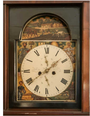
Clock Face Detail

To put this into local context, we have in our Education display a student’s work book dated 1843. The book is hand bound and the ink may be made from oak galls. The page shown contains arithmetic examples for sums of money, in both ‘English’ and Federal money - i.e., pounds, shillings, pence and farthings on the left, and dollars and cents on the right. The ‘English’ money was also Scottish money, although to this day three Scottish banks still issue their own banknotes, used only in Scotland. When currency was decimalized in the UK in 1971, farthings, ha’pennies and ‘thrupenny bits’ vanished. But in 1843, Mauchline and Greene schoolchildren had more to worry about than just pounds and pence. We do not know how or when the clock got from Scotland to Stanardsville, but we are very glad to have it.