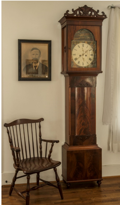
Ferguson Tall Case Clock