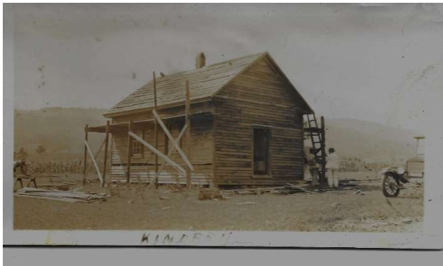
Kinderhook School Under Construction