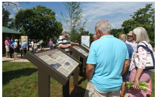
Information kiosk with walkway to Pavilion in the background