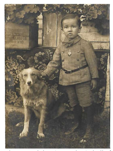
of unknown boy

We kicked off our African-American oral history project at the Greene County Juneteenth Commemoration, held at Greene Commons. We must quickly point out that although the organizer of the event was the Democratic Committee of Greene, we were there as the Historical Society not as a Political Society. It was a great opportunity to share some of the limited material that we have about this section of our community and we enjoyed meeting old friends and making new ones.