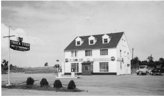
29 Truck Stop mid-1950s, 2007.13.01