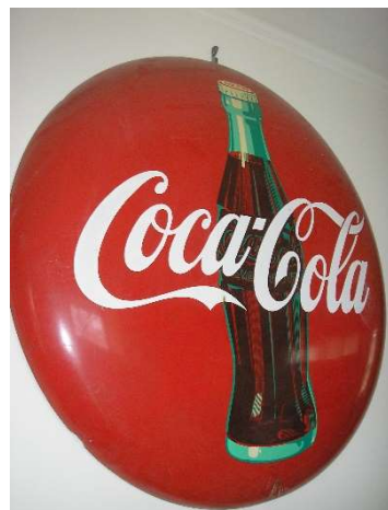
Coca Cola Sign 1985.09.18