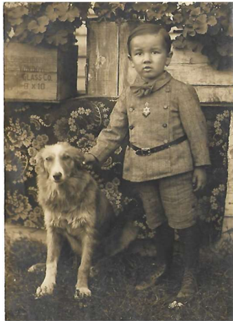
of unknown boy

We kicked off our African-American oral history project at the Greene County Juneteenth Commemoration, held at Greene Commons. We must quickly point out that although the organizer of the event was the Democratic Committee of Greene, we were there as the Historical Society not as a Political Society. It was a great opportunity to share some of the limited material that we have about this section of our community and we enjoyed meeting old friends and making new ones.