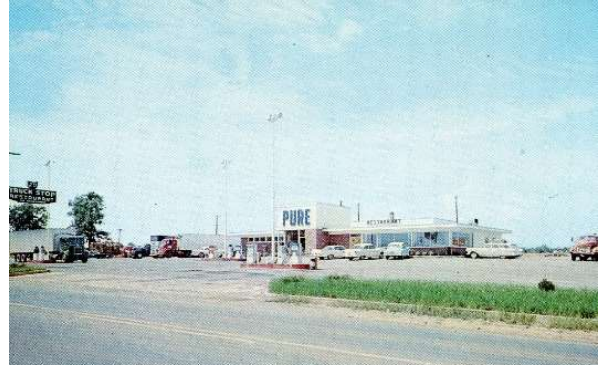
29 Truck Stop late 1950s, 2021.06.01