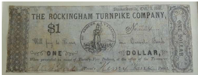
Rockingham Turnpike Company $1.00 promissory note. 2007.11.02