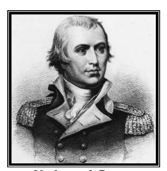
Nathanael Greene Major General of the Continental Army Born 1742--Died 1786