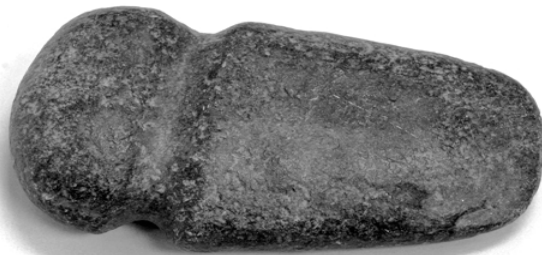
Stone Ax Head