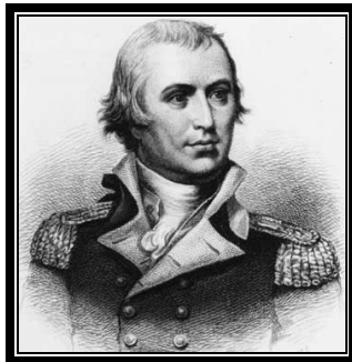
Nathanael Greene Major General of the Continental Army Born 5/27/1742--Died 6/19/1786