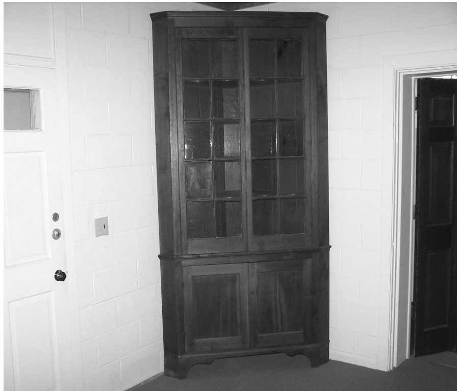
Rucker corner cupboard circa 1780