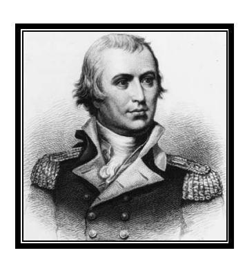
Nathanael Greene Major General of the Continental Army Born 5/27/1742-Died 6/19/1786