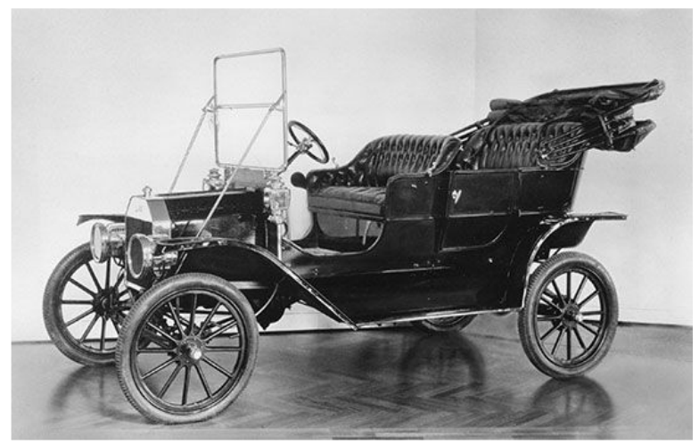
1909 Ford Model T "Tin Lizzy"