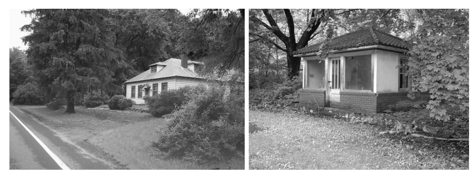
The Mt. View Tea Room building today.