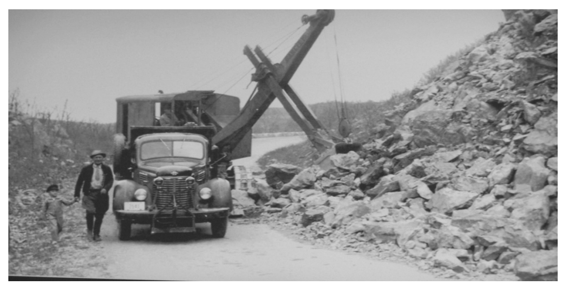
Pictures above are from Ranger Beck-Herzog's presentation and depict construction activities creating the Park.