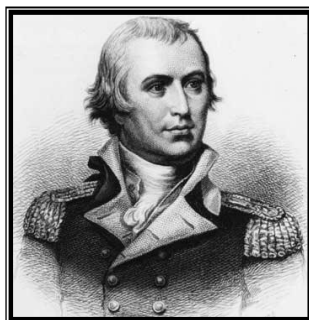
Nathanael Greene Major General of the Continental Army Born 1742--Died 1786

GCHS Members; if you have not already done so, please send your Email address to the GCHS at <infogreenehistory.org> for our record; we will not share your address with anyone.