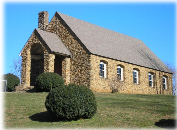
Cecil Memorial Church, Greene County, Virginia