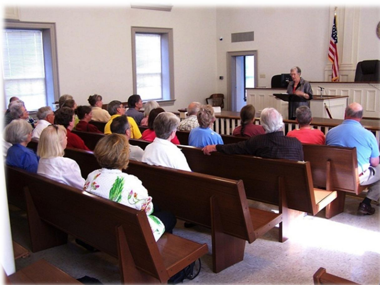
Some of the attendees.