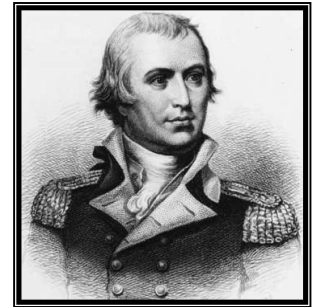
Nathanael Greene Major General of the Continental Army Born 1742--Died 1786