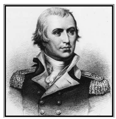
Nathanael Greene Major General of the Continental Army Born 1742--Died 1786