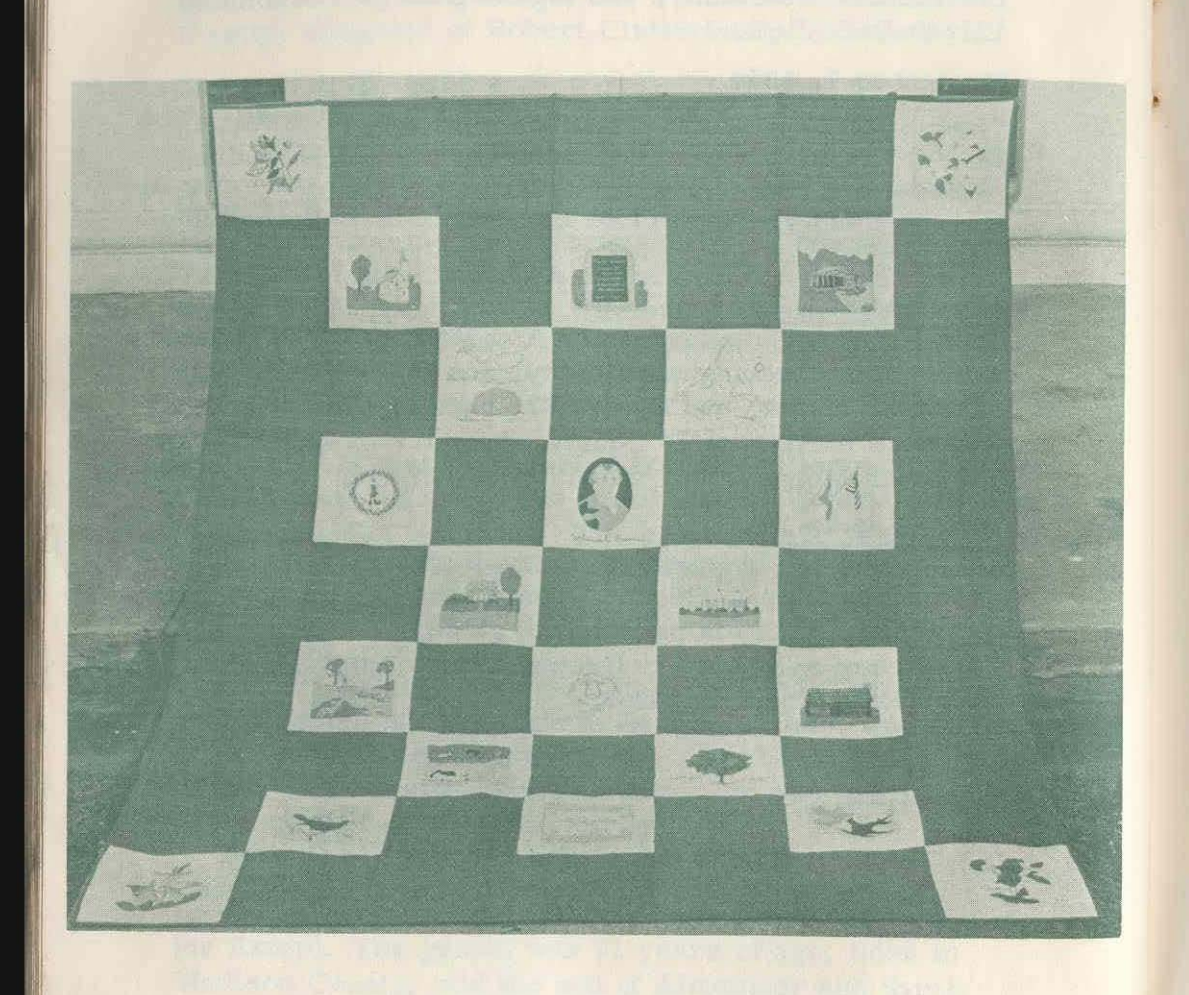
The Greene County Historical Society Quilt