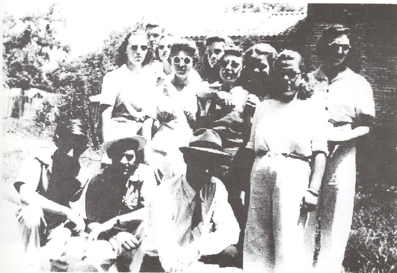
National Youth Administration on a Field Trip