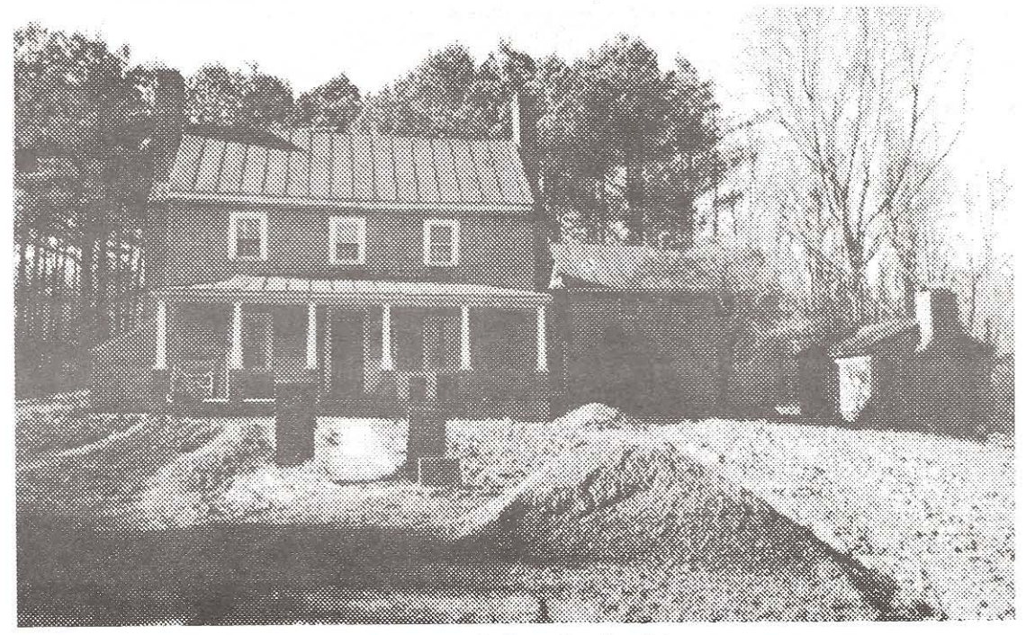
The Beadles House as it has looked in recent years