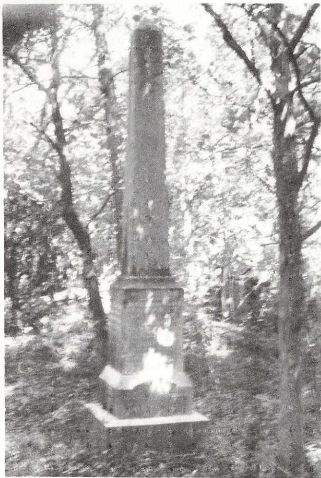
The Beazley Cemetery Monument