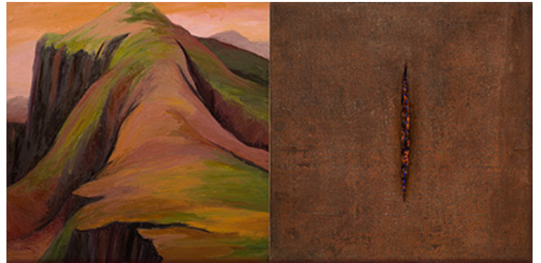
New Mexico Desert , 2011. Oil on wood panel, 40 x 80 x 2 in.