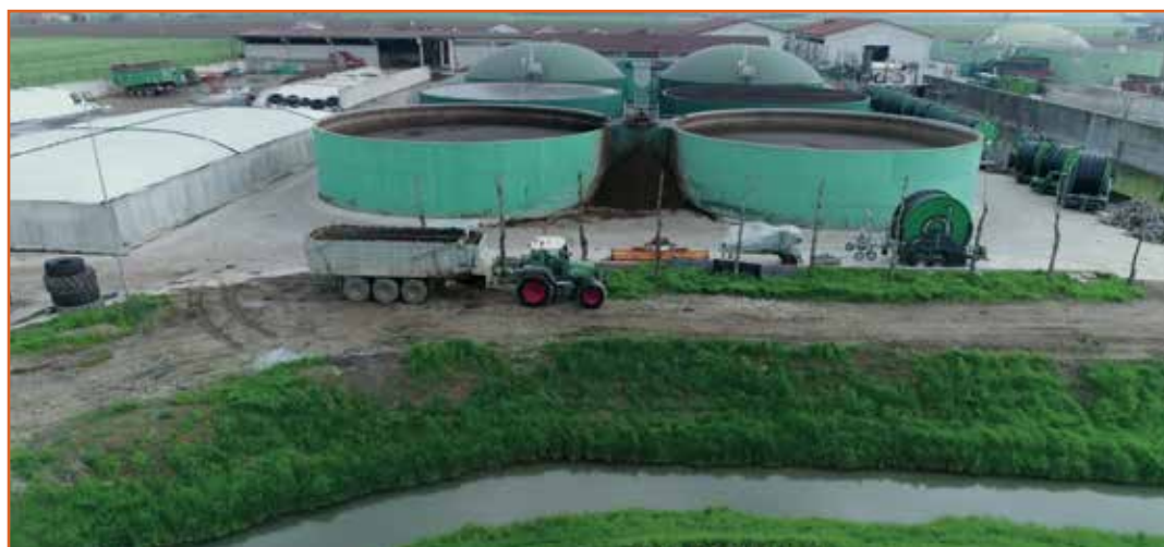
1,000 kW biogas plant in Salizzole, Italy successfully applying UltraPract P2 since Autumn 2017.

Following the initial observation period the application of the new product called “UltraPract P2” was started. The product features a specifically adapted enzyme preparation and includes the newly developed enzymatic AC (acceleration) factor. Following an initial concentration for twelve days to reach the enzyme target level the plant was supplemented at standard dosage for another 52 days. As before, the energy yield and the daily substrate quantities were recorded in the test phase. In addition, dry matter and organic mass of each individual substrate were determined on a weekly basis. Furthermore,