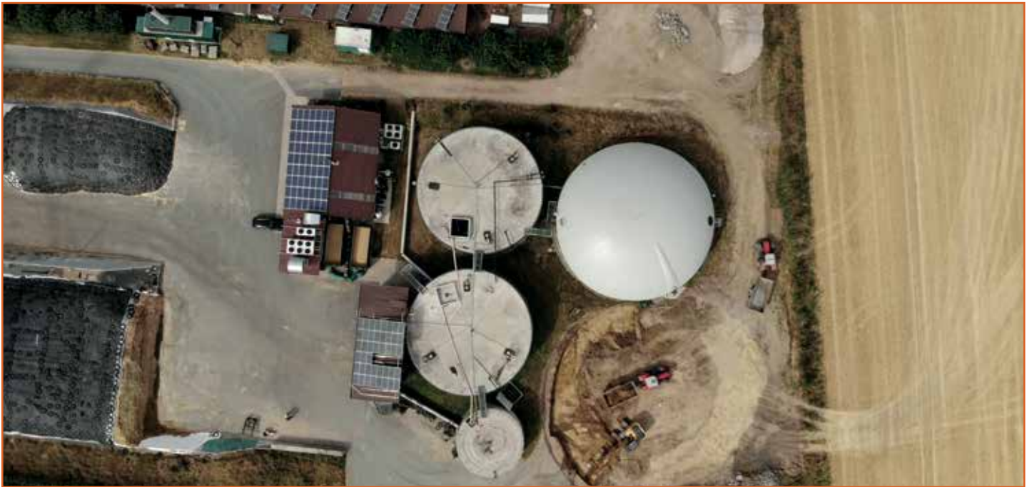
700 kW biogas plant in Schoepping, Germany successfully applying UltraPract P2 since Spring 2017; achieved a net increase in plant efficiency of 15%.

all substrate types were precisely characterised with the proximate feed analysis during both the reference and application periods.